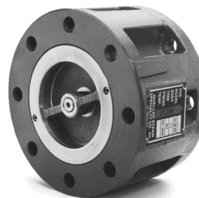
Model 101MAP, 103MAP

Models: 101MAP, Class 125, 103MAP, Class 250, Sizes: 1"– 10" (25 – 250mm)