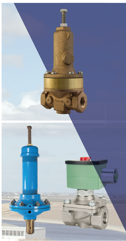
Effective January 6, 2025

All prices supersede previous issues, are temporary and subject to change without notice.