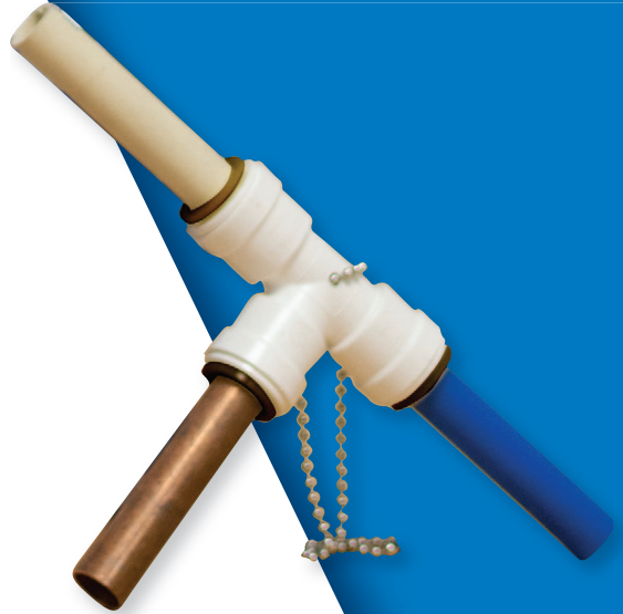
Bin System Sample Tee BSP100 Included in all Starter Kits

Buy a complete kit or order components separately to design your own