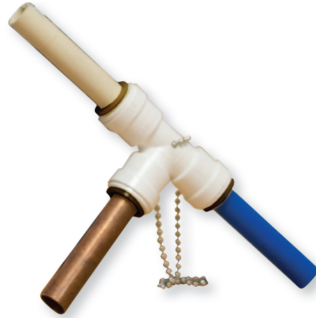
Bin System Sample Tee Part BSP100