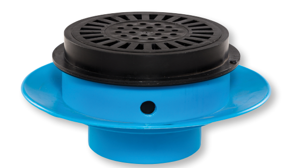
FRPP SF Pictured

The information contained herein is not intended to replace the full product installation and safety information available or the experience of a trained product installer. You are required to thoroughly read all installation instructions and product safety information before beginning the installation of this product.