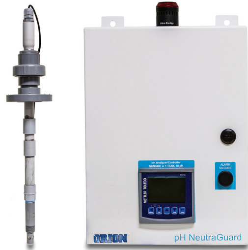
12" L x 16" H x 7" D

For System model selections please consult chart on next page.