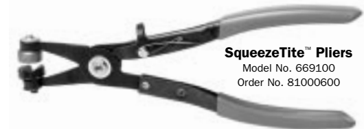
SqueezeTite™ Pliers Model No. 669100 Order No. 81000600

SqueezeTite Pliers are locking caliper pliers that allow worry-free handling of all sizes of our SelfTite clamps. This uniquely-designed tool prevents the SelfTite clamp from accidentally sliding free, as could happen with a standard pair of pliers or channel locks. With SqueezeTite Pliers, SelfTite clamps can be locked in the open position, freeing both hands to secure the Onix to the barb. SqueezeTite Pliers also open the clamp with no chance of deforming it, as is possible with ordinary pliers.