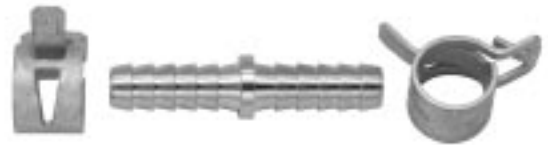
SelfTite Clamps and Onix splice.

WARNING: When installing SelfTites, the installer and any bystanders within twenty feet should wear approved safety glasses with side shields. A compressed SelfTite clamp contains enough kinetic energy to propel itself several feet into the air. While compressed, the clamp could slip off the pliers or installation tool and cause severe eye damage.