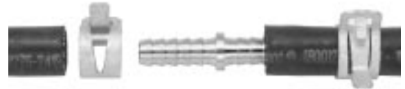
Making a splice using SelfTite clamps.