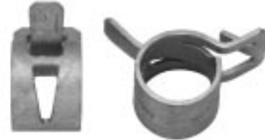
Watts Radiant SelfTite Clamps.

SqueezeTite Pliers are locking caliper pliers that allow worry-free handling of all sizes of our SelfTite clamps. This uniquely-designed tool prevents the SelfTite clamp from accidentally sliding free, as could happen with a standard pair of pliers or channel locks. With SqueezeTite Pliers, SelfTite clamps can be locked in the open position, freeing both hands to secure the Onix to the barb. SqueezeTite Pliers also open the clamp with no chance of deforming it, as is possible with ordinary pliers.