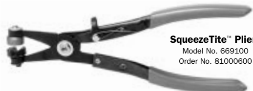
SqueezeTite™ Pliers Model No. 669100 Order No. 81000600

Using the SqueezeTite pliers to position a SelfTite clamp.