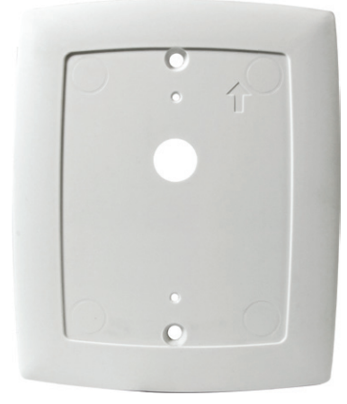
Adaptor Plate 012