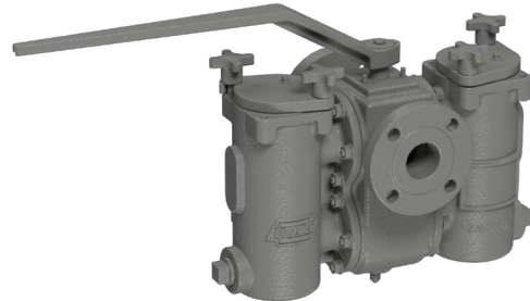
Model 792MFH SM

The information contained herein is not intended to replace the full product installation and safety information available or the experience of a trained product installer. You are required to thoroughly read all installation instructions and product safety information before beginning the installation of this product.