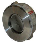
Model 1601 Front