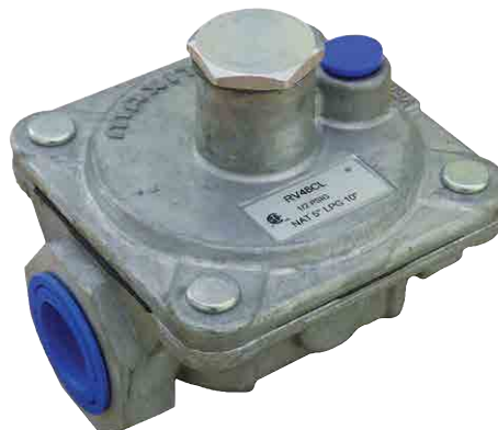
RV48CL-32_42 (1/2 PSIG Gas System)

Gas appliance regulators are designed for main burner and/or pilot applications, where precise control of tiny flows is an essential operating requirement. Housings are high strength aluminum castings and all models have been tested for multi-position and may be installed in any plane or angle without restriction. They may be used with natural, manufactured, mixed LP, or LP gas-air mixture.