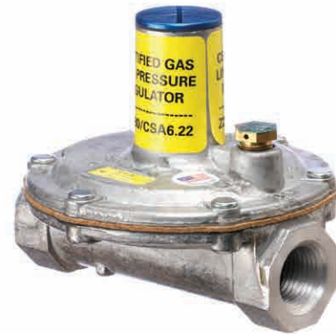
R325N32-0711-08 and R625N42-0711-08 (2 PSIG Gas System)

Line pressure regulators for 2 psi piping systems for use on residential, commercial and industrial applications. Features a high leverage linkage assembly to deliver positive dead-end lock-up. The regulators are capable of precise regulating control from full flow down to pilot flow. Housings are high strength aluminum castings and all models are suitable for multi-positional mounting. If ball check vent limiting device is installed, mount in an upright position only.