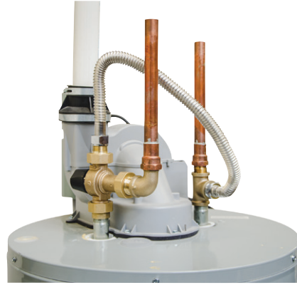
Extending Hot Water Tank Capacity with the LFLM496-HTK Mixing Valve (Based on 40 gallon Water Heater)