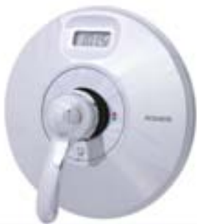
141 371 & 141 399 Shown