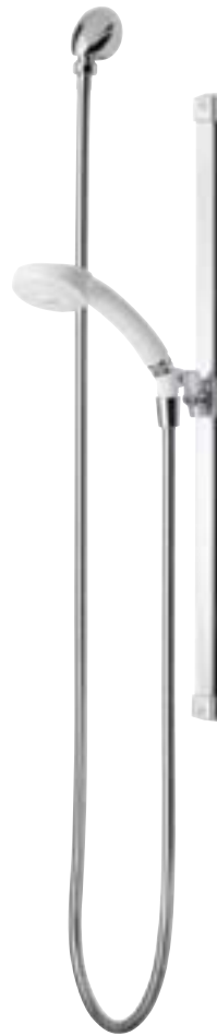
141 163 Shown