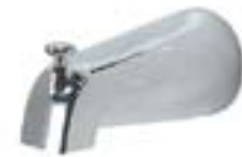
141 409 Shown

Tub spouts are available with and without diverters in 1/2" and 3/4" inlets. All spouts are chrome-plated.