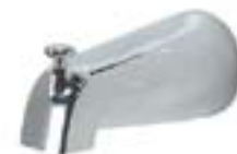
141 409 Shown

Showerheads are available in four models: deluxe chrome-plated brass, standard chrome-plated brass, adjustable massage, and economizer chrome-plated ABS. Arm and flange options include standard and deluxe chrome plated brass.