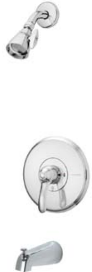
e707M1U000 Tub and Shower Assembly Shown