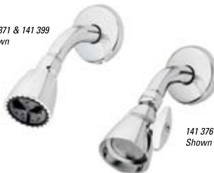
141 376 & 141 399 Shown

Showerheads are available in four models: deluxe chrome-plated brass, standard chrome-plated brass, adjustable massage, and economizer chrome-plated ABS. Arm and flange options include standard and deluxe chrome plated brass.