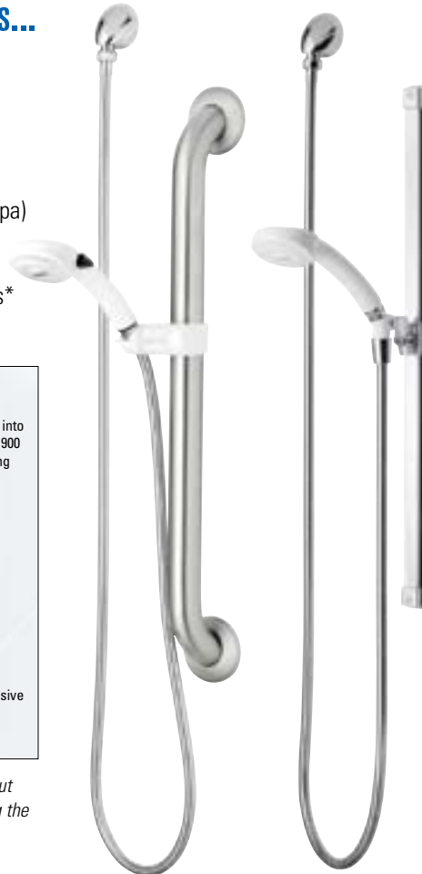
141 175 Shown