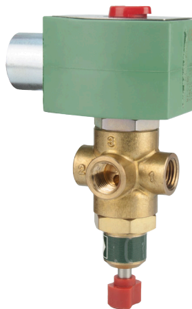
Model S3W Brass

Model S3W are pilot system 3-way solenoids. The solenoids can control valves independently or in combination with other control circuit pilots or accessories. Product is available with a wide range of options including: voltage (24 VDC or 120 VAC), operation (energize to open or closed) and a range of enclosures (general service to watertight to explosion proof).