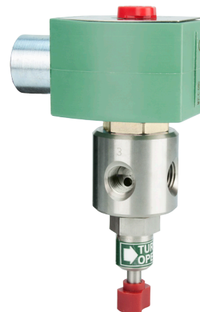
Model S3W Stainless Steel